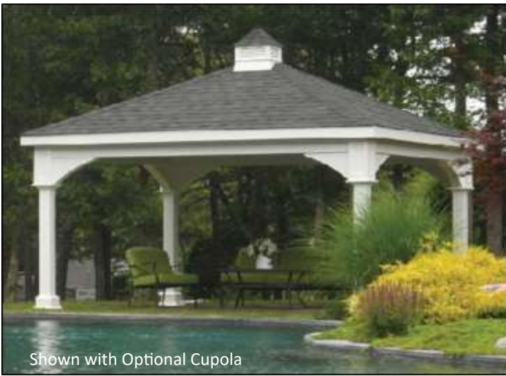
Shown with Optional Cupola