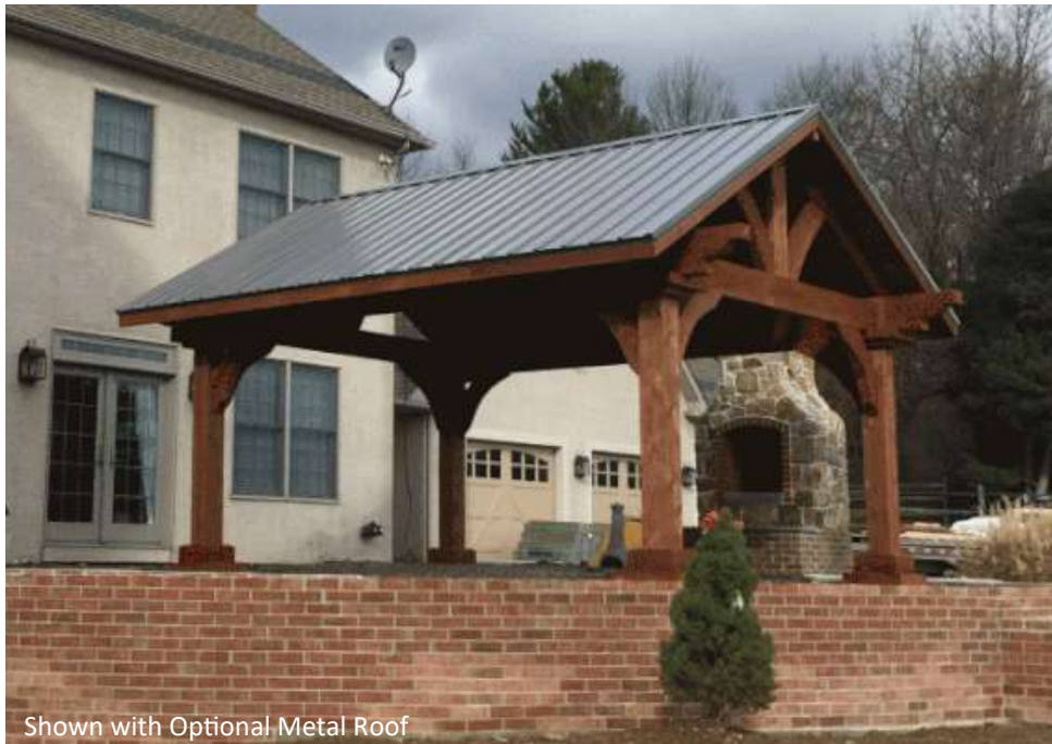
Shown with Optional Metal Roof