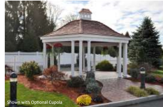
Shown with Optional Cupola

642 Turnpike St N. Andover, Ma 01845 978 688 4222 EASTERNSHED.COM